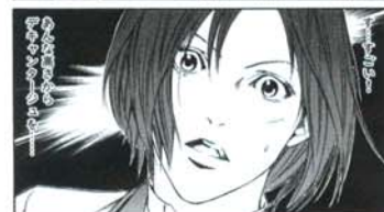
ASTRO BOY, LOOKOUT! Cartoon character Shizuku Kanzaki on his quest for the "12 Apostles" of wine.